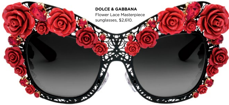
DOLCE & GABBANA Flower Lace Masterpiece sunglasses, $2,610.