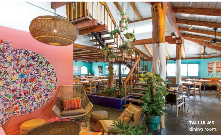
TALLULA'S dining room.