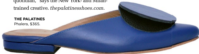
THE PALATINES Phalera, $365.